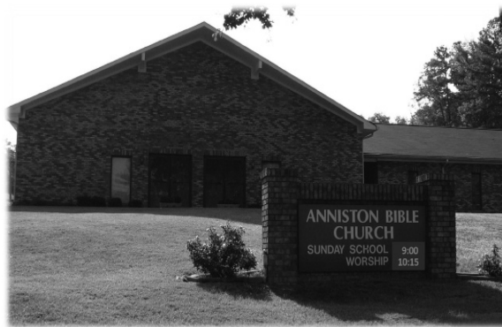
Classes will meet at Anniston Bible Church

If you have questions or are interested enrollment please call the seminary office at 205.776.5650.